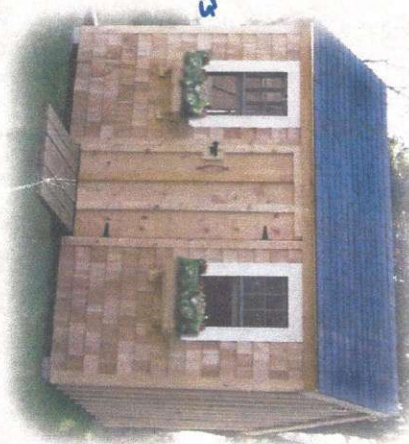
Nantucket Salt Box