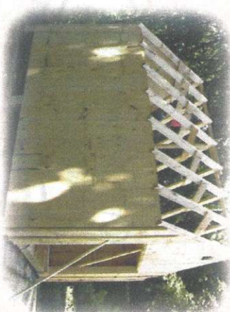
Post and Beam Construction